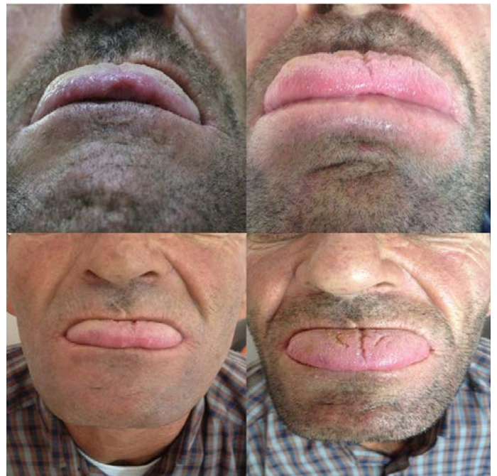
Figure 1: The appearance of the tongue, post-excisional biopsy and post-treatment

The dermatological examination showed a 1x1.5 cm ulcerated white plaque in the mid part of the tongue, and he underwent excisional biopsy (Figure 1) for preliminary diagnosis of squamous cell carcinoma, leukokeratosis, leukoplakia, lichen