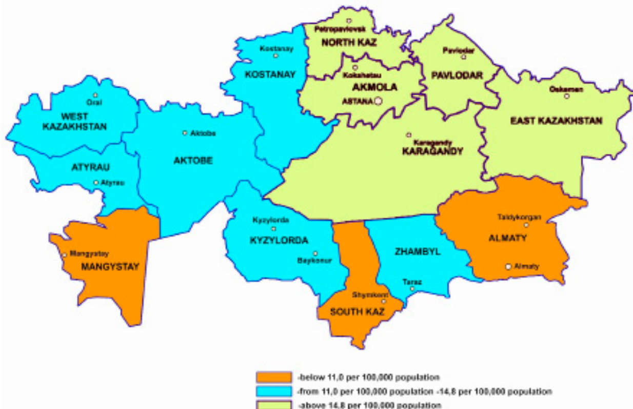
Figure 2. Stomach cancer morbidity in certain regions of Kazakhstan in 2013.

the morbidity was >14.8/100,000 of the population. As a result, the high level of morbidity covered the entire north-east section of the country, while the medium level was typical for the west and north-west regions, and the regions with a low level were located in the south, south-west and south-east sections of the country. A significant difference between the maximum and minimum rates was apparent when studying SC prevalence. The fluctuation amplitude of the frequency between the end rate was 2.3 in certain regions of the country in 2004 and in 2013. When calculated from a perspective of each region,