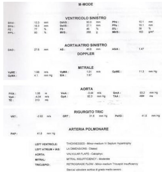
Figure 2. Findings of echocardiography

We tried to investigate the patient looking for one or more pathological conditions that could explain the big picture as a whole(7). The symptoms reported were not part of the prodromal symptom of dementia (MMSE , ADL and IADL were normal) (8-10). Aortic valve stenosis (previously known) was confirmed with echocardiography, but dyspnea was certainly exacerbated by the anemic condition. The hypercreatininemia, detected on multiple testing in a extremely dehydrated patient could not justify the degree of anemia detected on the analysis, requiring a transfusion (11,12). The iron levels, the folate and vitamin B12 values were normal (13). The patient was underweight (BMI 24.9) and nutritional parameters (albumin, lymphocytes) were good (14). The drug history was inconclusive: the patient did not take antiplatelet agents, corticosteroids, non-steroidal anti-inflammatory drugs or other gastrolesive medications. The fecal occult blood test appeared firstly negative on a single control (enzymatic method) and subsequently