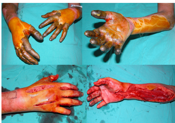
Figure 2. Upper left and right; fire burn of both hands and the forearm. Below left; the hand dorsal. Below right; forearm following fasciotomy.

The first eight hours in the evaluation of compartment syndrome is called the “early phase” while the time that exceeds eight hours is called the “late phase” (2). The