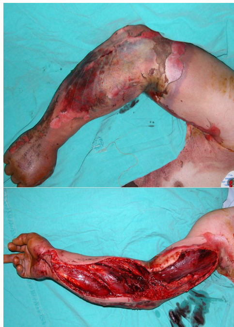
Figure 3. Upper: Electric current burn, Below: Arm-forearm following fasciotomy; edema and burns in the muscles attract attention.

period between the start of the increase in post-traumatic intracompartmental pressure and the fasciotomy procedure is very critical and the procedure should be performed within this early phase. If reperfusion is not achieved within this period irreversible tissue injury takes place (2, 11). The late period is characterized by increase in vascular permeability, cellular anoxia, local metabolic changes, cell death, and the secretion of catabolic enzymes. Irreversible damage to the muscles starts to take place in this period. This condition ends in a process including ischemic contracture in the extremity and even amputation. Irreversible peripheral nerve changes are added to the condition, in addition to muscle necrosis, in extremity ischemia that exceeds 12-24 hours (11). All the cases, except two, were diagnosed within this critical period and received fasciotomy. A case with electric burn received fasciotomy in the late phase because of a delay in the transfer to our hospital from other medical centers, while another case with chemical burn had fasciotomy in the late phase because of delayed edema.