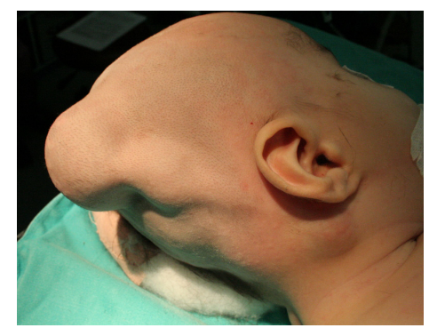
Figure 3. Appearance of the subdermal collection of a patient with VP shunt dysfunction prior to surgery.

is 37.2° C while there was no finding related with a stiffen neck. Radiological studies showed that, in direct cranial graphs the proximal catheter was collected under the scalp (Figure 1). In a brain tomography study, it was also found that the proximal catheter came out from the ventricle and was located under the scalp (Figure 2). The patient was diagnosed with a VP shunt dysfunction and immediately underwent surgery (Figure 3). During