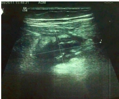
Figure 1. An abdominal US shows pericecal focal fluid that surrounding with omentum.

emergency conditions due to rapid onset of the symptoms, for which reason the definitive treatment is made during operation. No robust consensus is achieved over the treatment modalities. The management described in the literature contains a large amount of variations ranging from implementation of a simple antibiotherapy to a sophisticated right hemicolectomy (4).