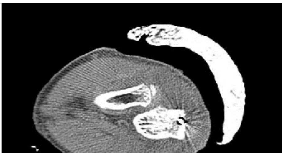
Figure 2. You can see an old fracture on proximal part of ulna, metallic fixation material, and streaking artefact on routine axial CT image (A). Fracture and displacement way is seen without any artefact on 3D VR image (B).

Spiral CT has two major roles in musculoskeletal trauma: These are to define or exclude a fracture that was equivocal at plain radiography and to determine the extension of fracture and thus provide guidance for therapy. Spiral CT will provide additional information about soft-tissue abnormalities and demonstrate osseous