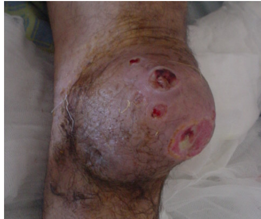
Figure 1. Appearance of the knee during the admission. The knee is and erythematic swelled with local ulceration.

tected postoperatively and the patient was discharged 10 days after the operation. The patient had 100 degree flexion and full extension after 45 days postoperatively, and he continued to work as a farmer.