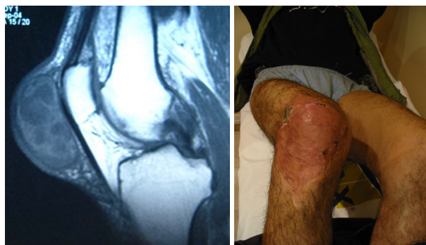
Figure 2a-2b. Sagittal T-1 weighted MR image of the knee demonstrate an enlarged prepatellar bursa. After administration of intravenous contrast material demonstrates marked inflammatory change at the margins and central necrotic/cyst formation.

differs from that of simple bursitis. The more heterogeneous appearance on MR imaging is due to the constitution of blood and blood products, fluid and inflammatory changes. The authors are unaware of previous reports of septic bursitis associated with haemorrhagic bursitis in English language literature.