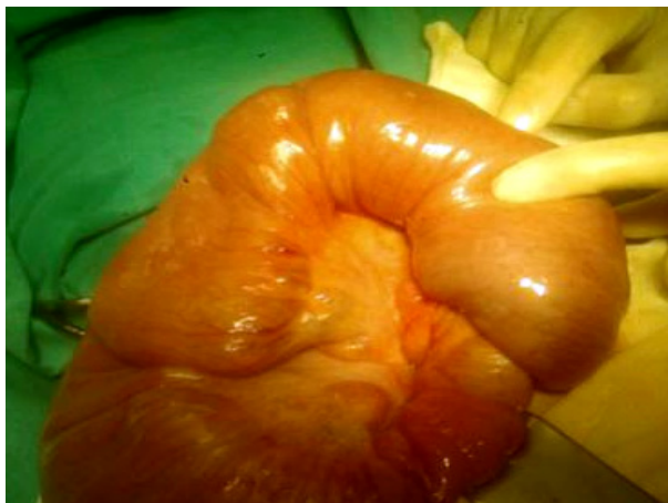
Figure 1. Operative finding of jejuno-jejunal intussusception