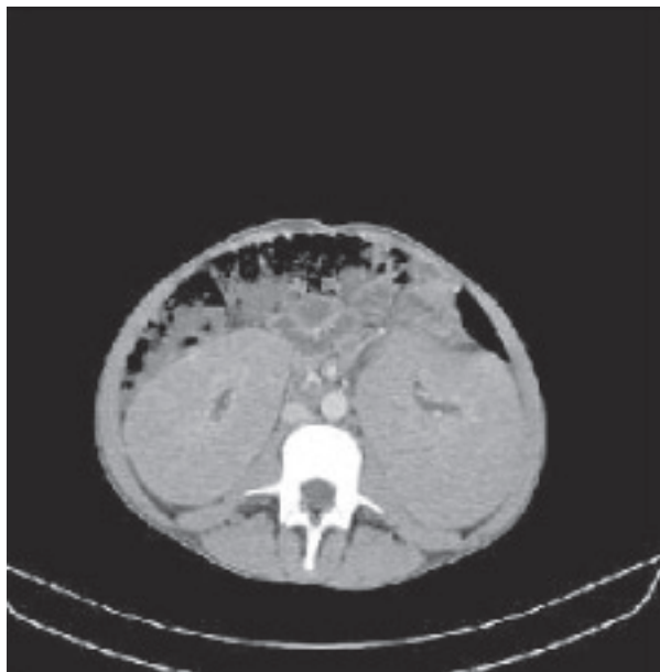
Figure 1. Computed tomographical examination revealed bilateral diffuse renal enlargement without any functional abnormality. There was no detectable focal lesion in the both kidney.

Because there was no response to iron supplementation on the 15th day of the treatment, the patient has referred to our hospital. He had a significant pallor, tachycardia (130/min) and a few petechiae eruptions on the lower extremities. His blood pressure was 130/80 mmHg. He had an enlarged liver and spleen both palpable 5 cm below the costal margin at the midclavicular line. The kidneys were bilaterally palpated as two solid tumor masses with smooth surface engaging the whole abdomen. There was no evidence of lymphadenopathy. The results of the complete blood count were as follows: hemoglobin 2.9 g/dl, mean corpuscular volume (MCV): 62 fl, white blood cell count 4.2 \times 10^9/l , and platelet count 60 \times 10^9/l . A peripheral blood smear revealed 80% lymphocyte, 2% monocyte and 18% neutrophil with inadequate platelets. Urine microscopy revealed no haematuria and there was no detectable proteinuria. Serum biochemistry, coagulation parameters (prothrombin time, activated partial thromboplastin time and fibrinogen level), vitamin B12, and folic acid levels were in the normal range except for elevated serum creatinine (1.4 mg/dl), uric acid (12 mg/dl), LDH (1100 U/L) levels. These elevated values returned to normal ranges after the treatment following anti-cancer chemotherapy (serum creatinine: 0.9 mg/dl, uric acid: 3.3 mg/dl, LDH: 514 U/L). Serological tests